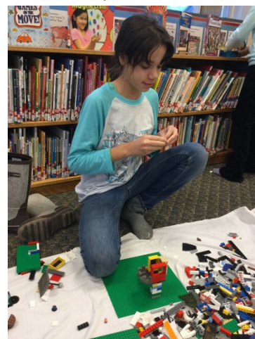
Lego Club Tuesdays 3:30